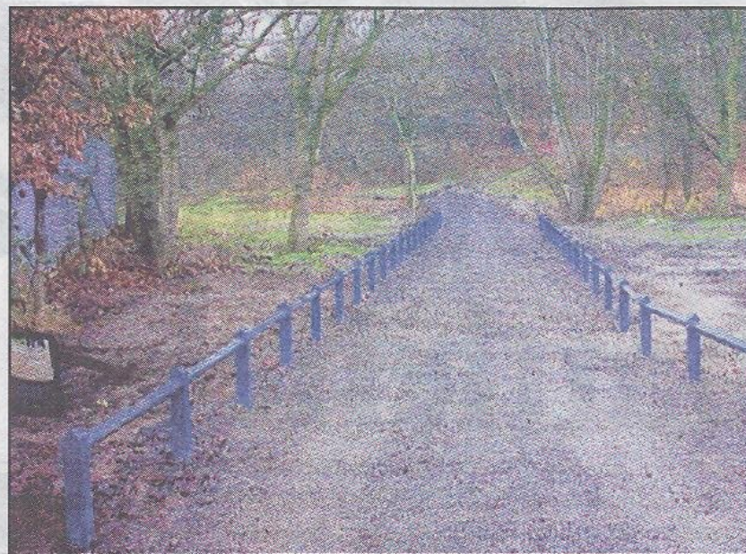
THE new entrance to Blackley Forest

John said: "The transformation gives an appearance of order and belonging, making it more inviting and appealing to visitors who want to enjoy walks in comfort. Next spring, the immediate area will be planted with flowering shrubs and wild flowers to further enhance the aesthetic appearance."